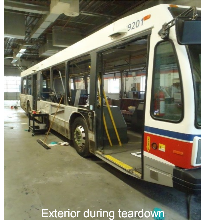
Exterior during teardown