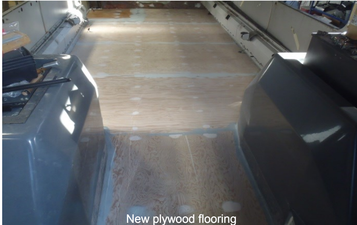
New plywood flooring