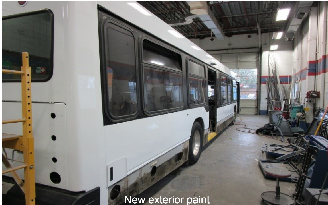
New exterior paint