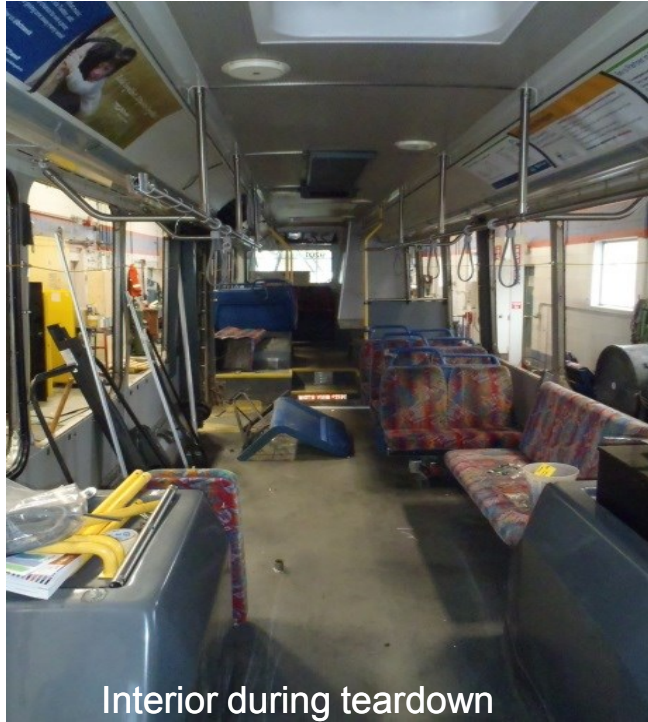
Interior during teardown