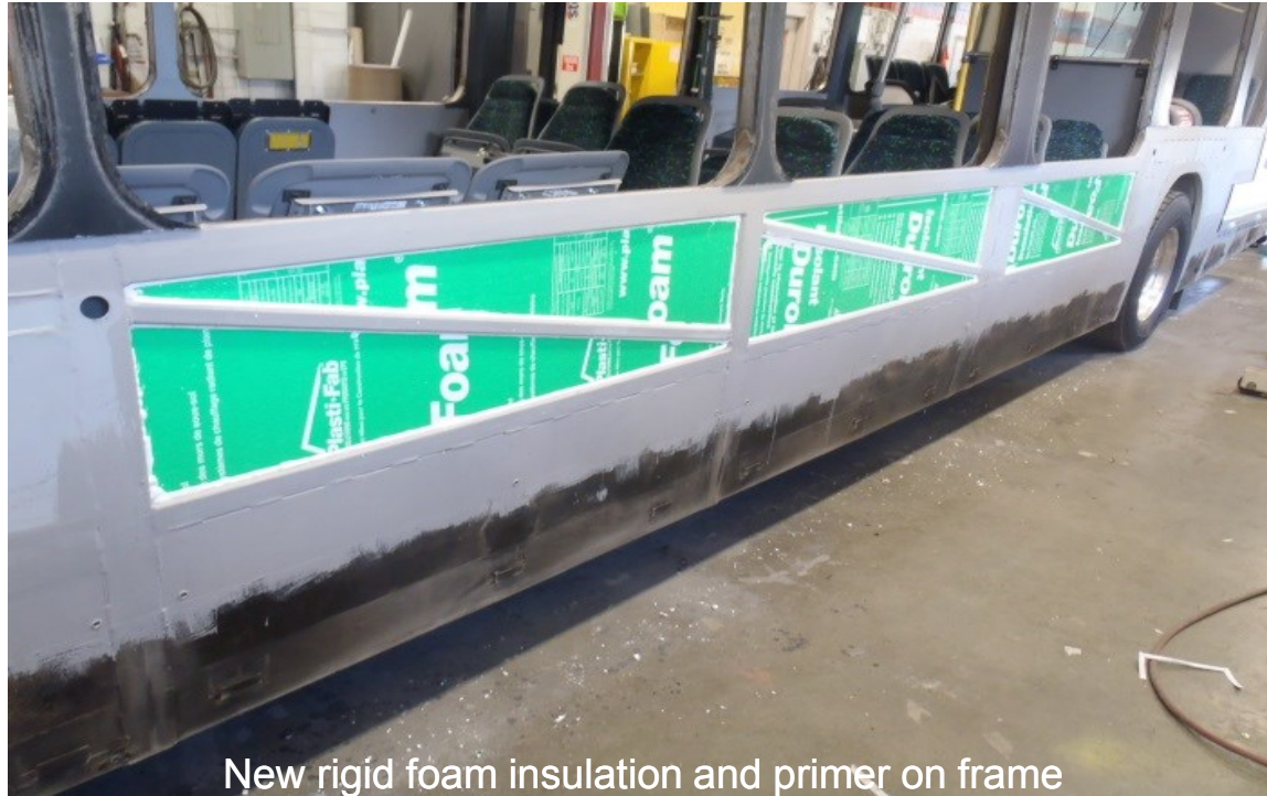
New rigid foam insulation and primer on frame