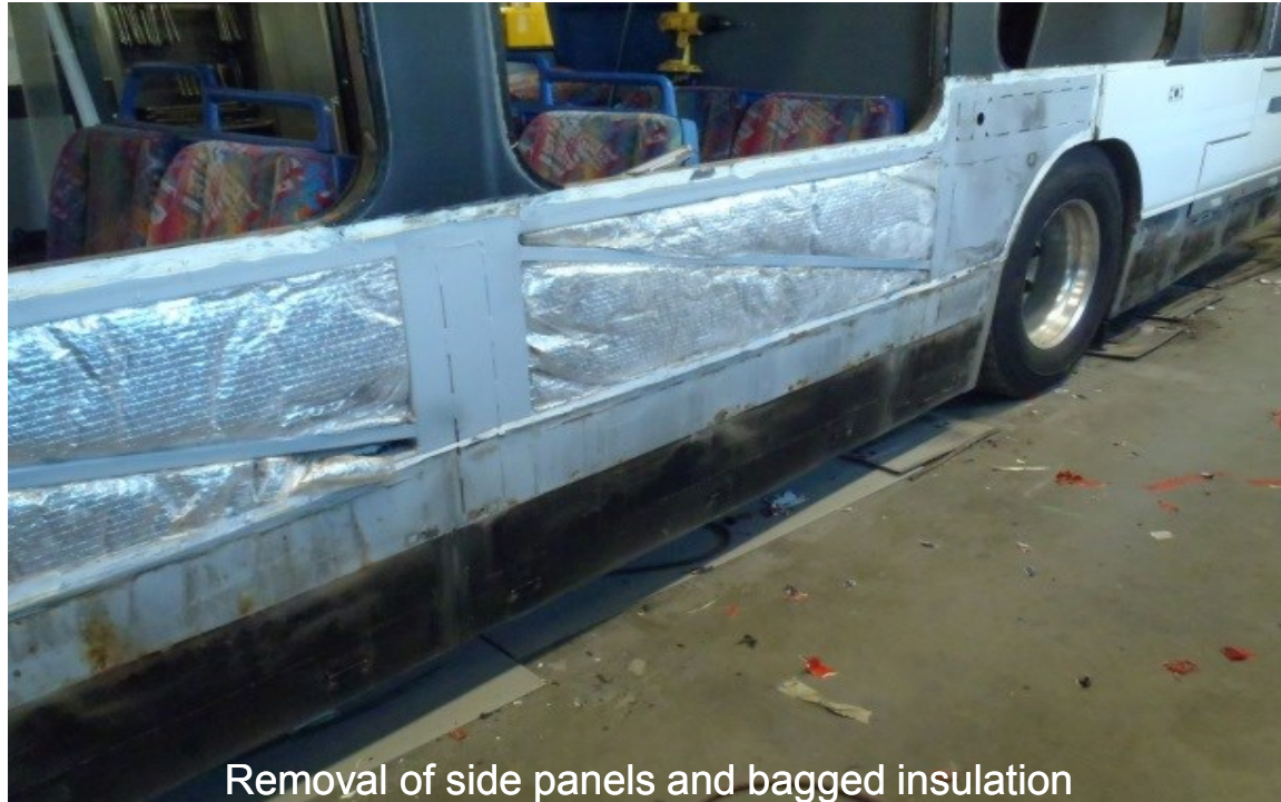
Removal of side panels and bagged insulation