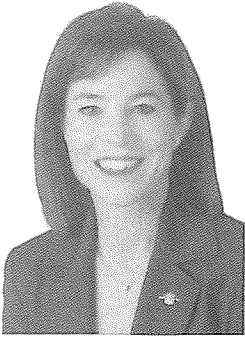
Selina Robinson, MLA (Coquitlam-Maillardville)