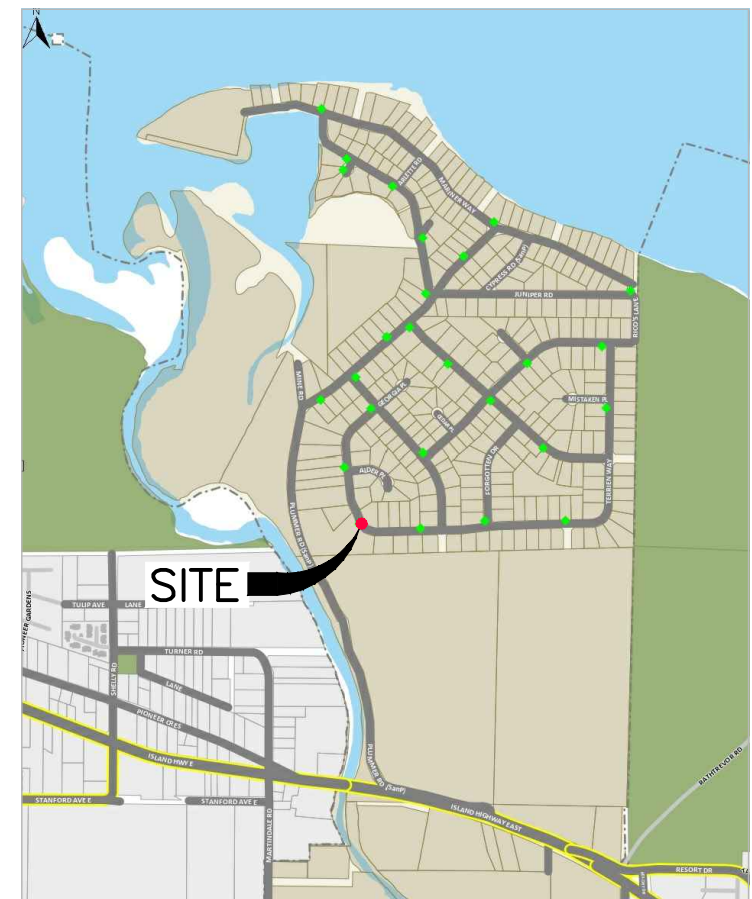
LOCATION PLAN NTS