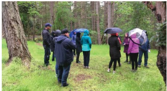
Workshop participants at Moorecroft Regional Park.