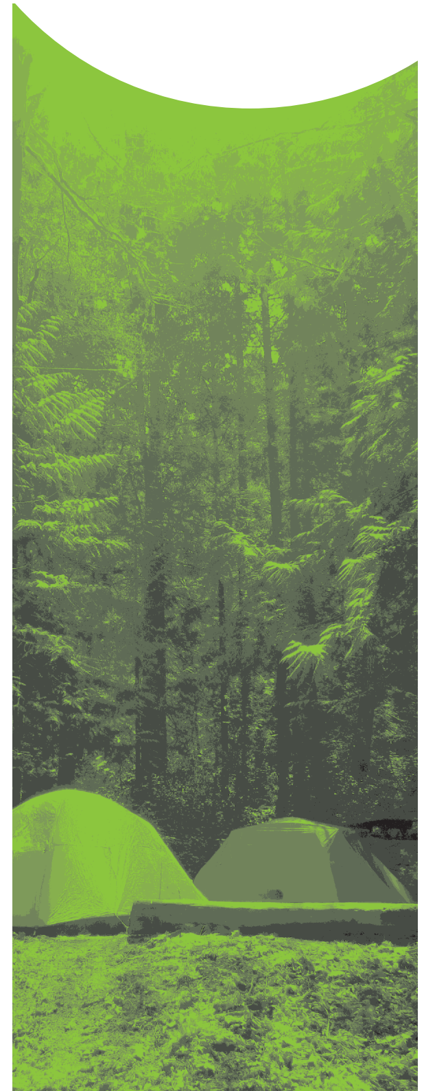
Descanso Bay Regional Park