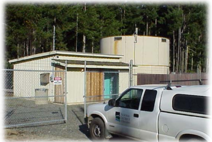
Melrose Pumphouse and Reservoir

The water distribution system in Melrose is comprised of 0.3 km of 150mm PVC watermains. There are no fire hydrants located within the system.