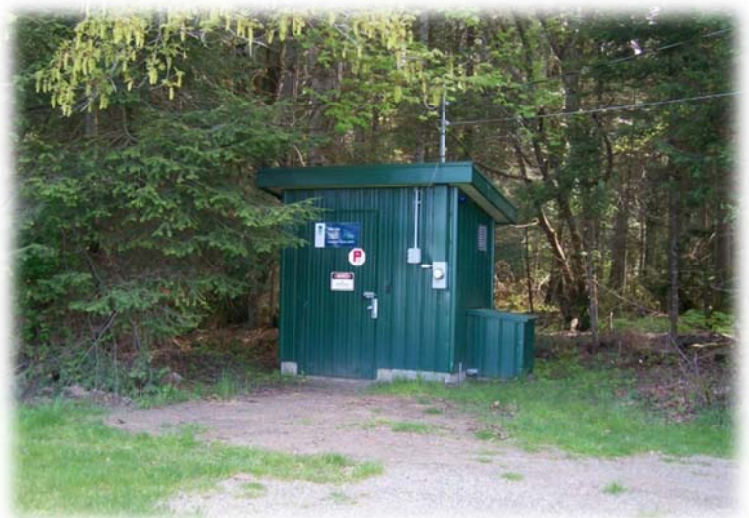
Surfside Pump house

Very few complaints and inquiries were received from the Surfside water service area, and were typically related to watering restriction times.