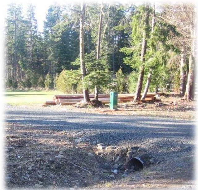
Watering Sampling Station on Rascal Lane

A few complaints and inquiries were received from the Englishman River Water Service Area in 2012, and were typically related to irrigation leaks and high water bills.