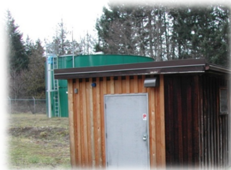
French Creek Main Pump House and Reservoir

Twenty-four hour on-call coverage is in place to respond to water system emergencies and alarms.