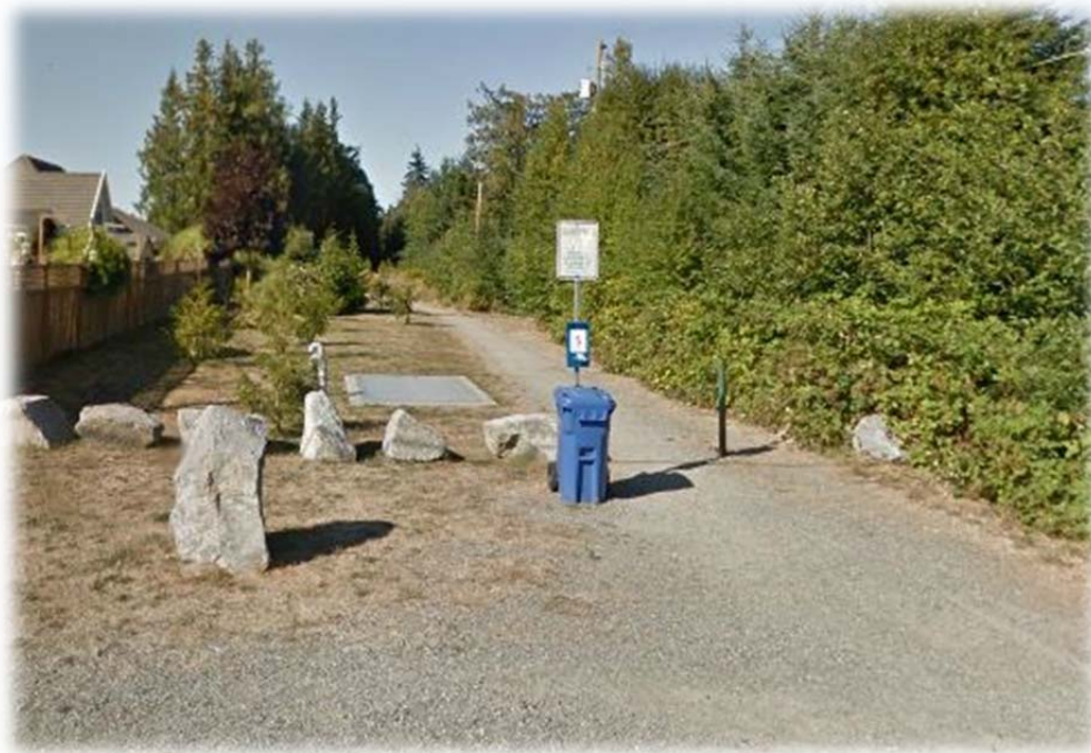
Yambury Road Watermain Right of Way

An annual report for the year 2013 will be prepared and submitted to the Vancouver Island Health Authority in the Spring of 2014. Annual reports are also available on our website at www.rdn.bc.ca in the SERVICES section, under Water & Utility Services then WaterSmart Communities.