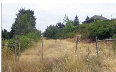
Undeveloped trail south of Hemer Rd.