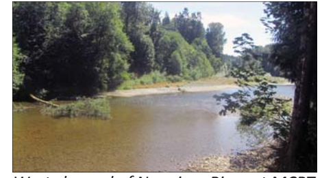
West channel of Nanaimo River at MCRT

A copy of each plan is available at the Open House. Links to each plan are also available on the project website at www.rdn.bc.ca/MCRTbridges .