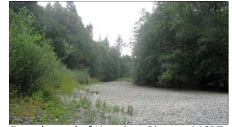
East channel of Nanaimo River at MCRT