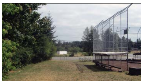
Undeveloped trail south of Cedar Rd.

Undeveloped segment of the MCRT (approximately 1km between Nanaimo River and Cedar Road).