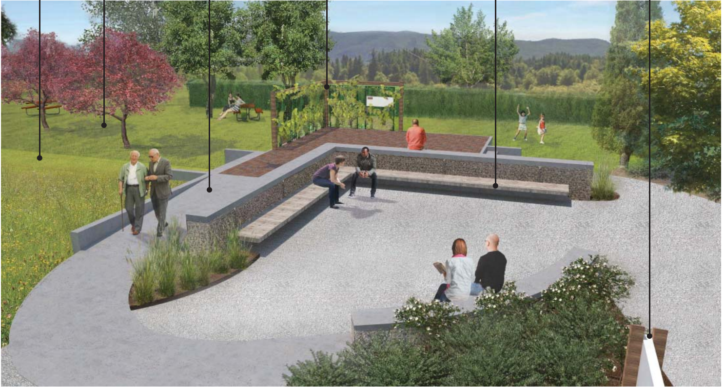
Main Activity Area (looking west)