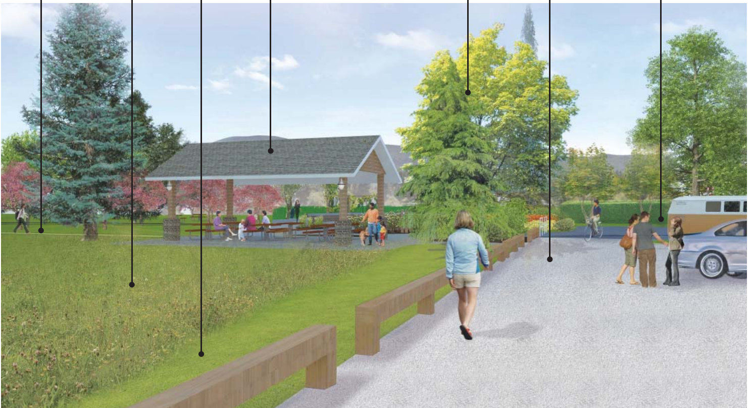
Picnic Shelter and Field (looking west)