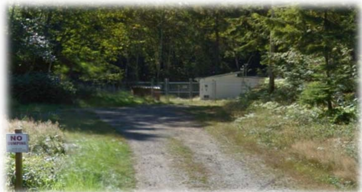
Water Intake Location and Pumphouse

In 2018, a stand-alone Cross Connection Control Bylaw will be adopted that contains definitions, authorizations, applications, liability, rules, regulations, testing requirements, and reporting requirements. The bylaw will address retrofits, prohibitions, special circumstances, reclaimed water use, alternate water sources, failure to comply, inspections, testing, offences, penalties and more. Sections of the existing RDN Water Supply Bylaw No. 1654 will be repealed so they do not conflict with the new Cross Connection Control Bylaw. A webpage will be established on the Water & Utility Services website that will educate RDN customers about cross connections and list the relevant links to current standards and resources.