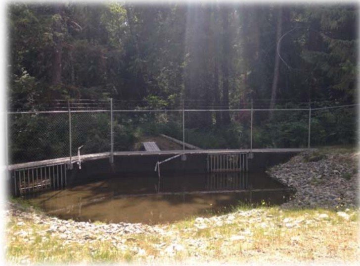
Infiltration Pond on Crocker Creek

An annual report for the year 2018 will be prepared and submitted to Island Health in the Spring of 2019. Annual reports are also available on our website at www.rdn.bc.ca in the SERVICES section, under “Water & Utility Services” then “WaterSmart Communities”.